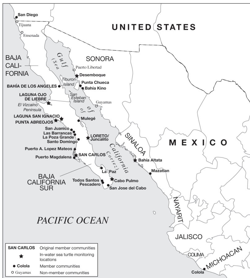
Figure 1. Map of Northwestern Mexico

Similarly, this paper will consider the evolution of the relationship between humans, the environment, and sea turtles in northwestern Mexico. Specifically, we will examine the centuries-old relationship between people and sea turtles and the diverse nutritional, economic, and cultural values that these animals have held for