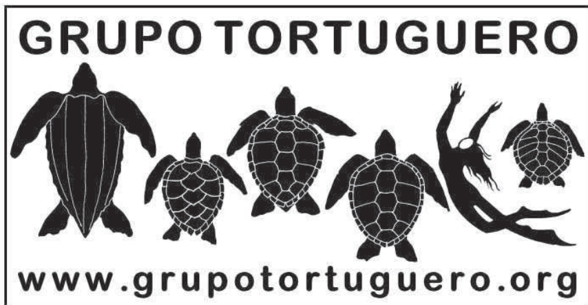
Figure 2. GT LOGO