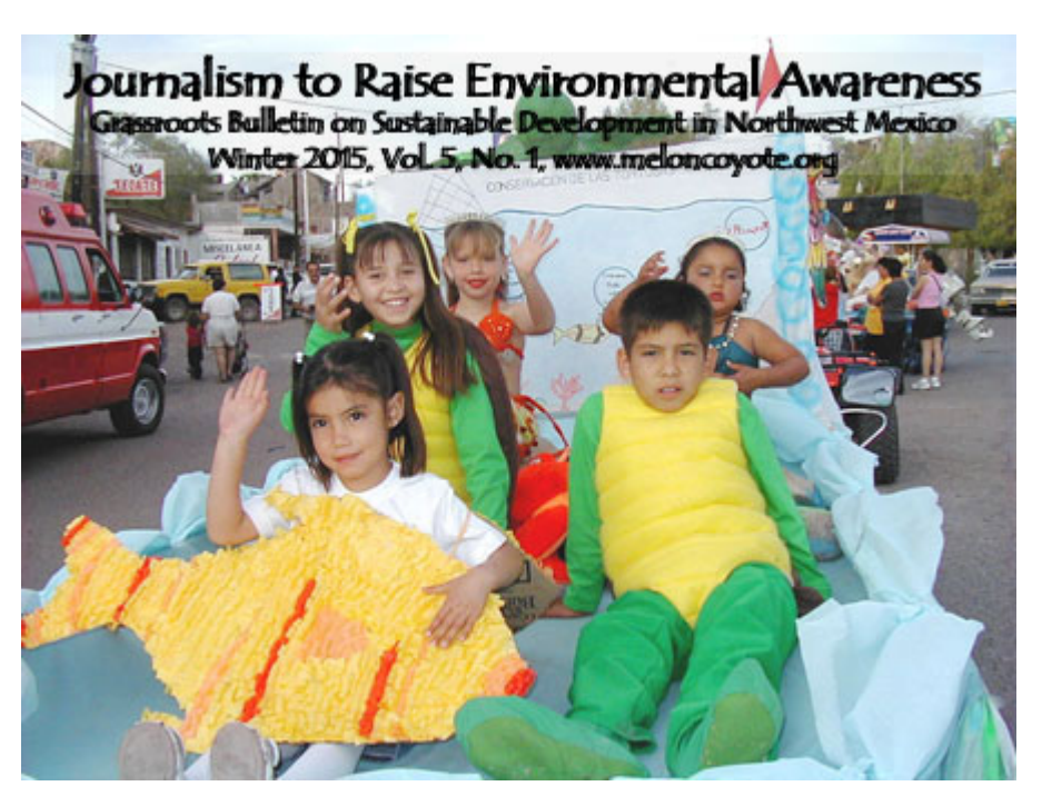
Mulegé, BCS. Spring Carnival promoted respect for the ocean. ( Photo: Debra Valov ).