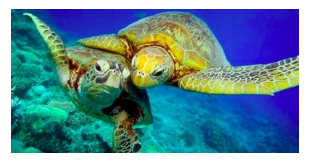
Experts call it the